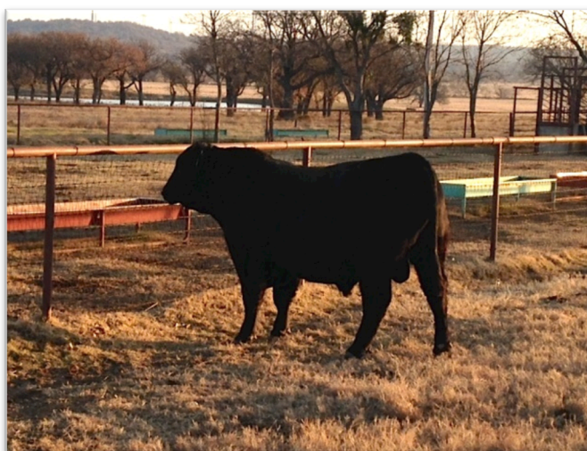
GLC MA 5E3 at his new home in Texas.

You Can Do it, Too: Although most Virginia operations are smaller than what we saw in Texas, the same principles apply. Quality bulls can and will continue to add to your bottom line. We saw the proof.